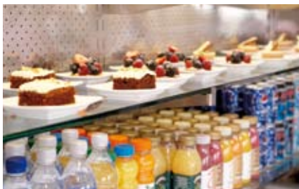
Tasty, yet nutritious, desserts increase the appeal of healthy eating

The serving of chips in staff canteens provides a good example of how actions can be tailored to the particular situation of the business. Our Healthy Eating Steering Group members surveyed for this publication reported variously taking chips off the menu completely; surreptitiously reducing the fat/salt content by providing oven chips ('health by stealth'); providing alternatives (e.g. salad) alongside chips, and/or making chips continuously available. Each decision was based on a practical evaluation of the needs of the workforce and the business.