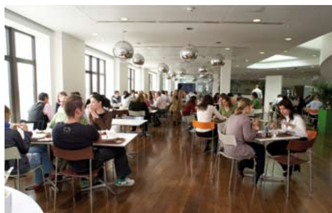
Unilever provides a pleasant physical and social environment which encourages employees to dine in staff restaurants where they can take advantage of healthy eating options

For employers, promoting 'healthy eating' means ensuring that employees have access to a balanced range of food and drink which helps maintain their energy and productivity levels at work and which contributes to an overall balanced diet. While every employee must be free to choose what they eat, employers should support them in maintaining their health by raising awareness of how diet contributes to their health and wellbeing; by ensuring that an appropriate range of healthier choices is available to them at work; by taking action to make mainstream choices healthier; and by providing a physical and social environment that supports healthier choices.