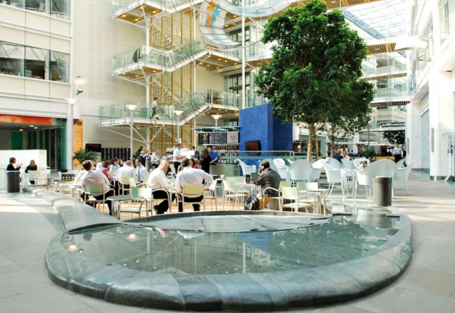
GlaxoSmithKline's provision of clean, bright, smoke-free surroundings, separate from work areas, where employees can eat, relax and socialise is as vital to promoting healthy eating as the actual food on offer