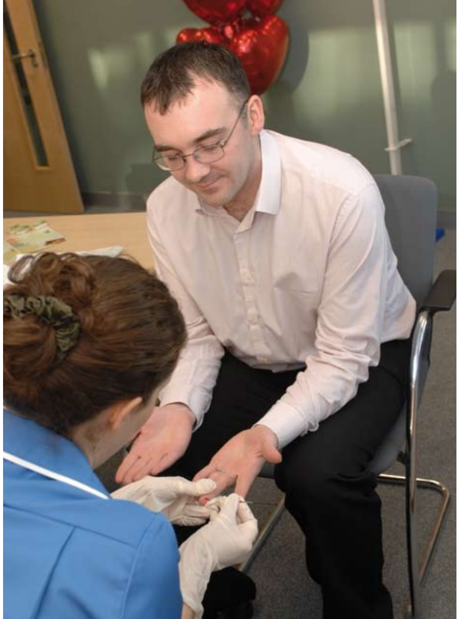
ARAMARK provide a number of health checks for employees including testing cholesterol levels

Additional KPIs suggested by the Steering Group which relate specifically to healthy eating included: