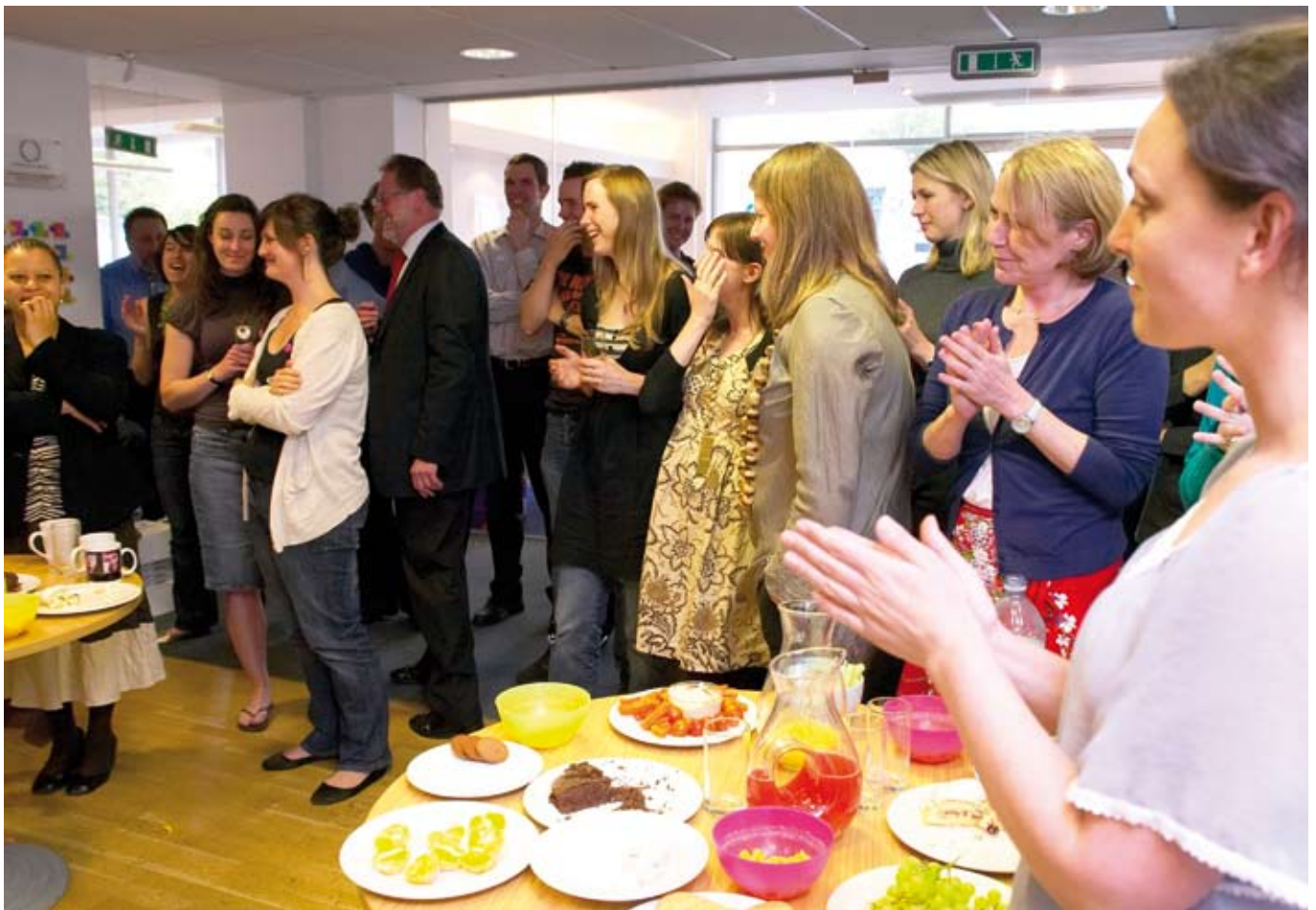
Regular staff gatherings, such as Business in the Community's weekly Friday tea, provide opportunities for socialising and celebrating the achievements of individuals and teams

Beyond providing the body with essential nutrients, healthy eating is an activity which can promote employees' mental health by enabling them to take time out of the working day to relax. Spending time with others while eating also helps strengthen social relationships at work and provides informal opportunities