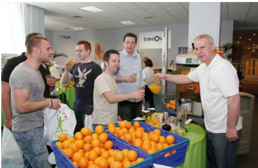
Cadbury actively encourages employees to sample fresh foods to help build healthy eating habits