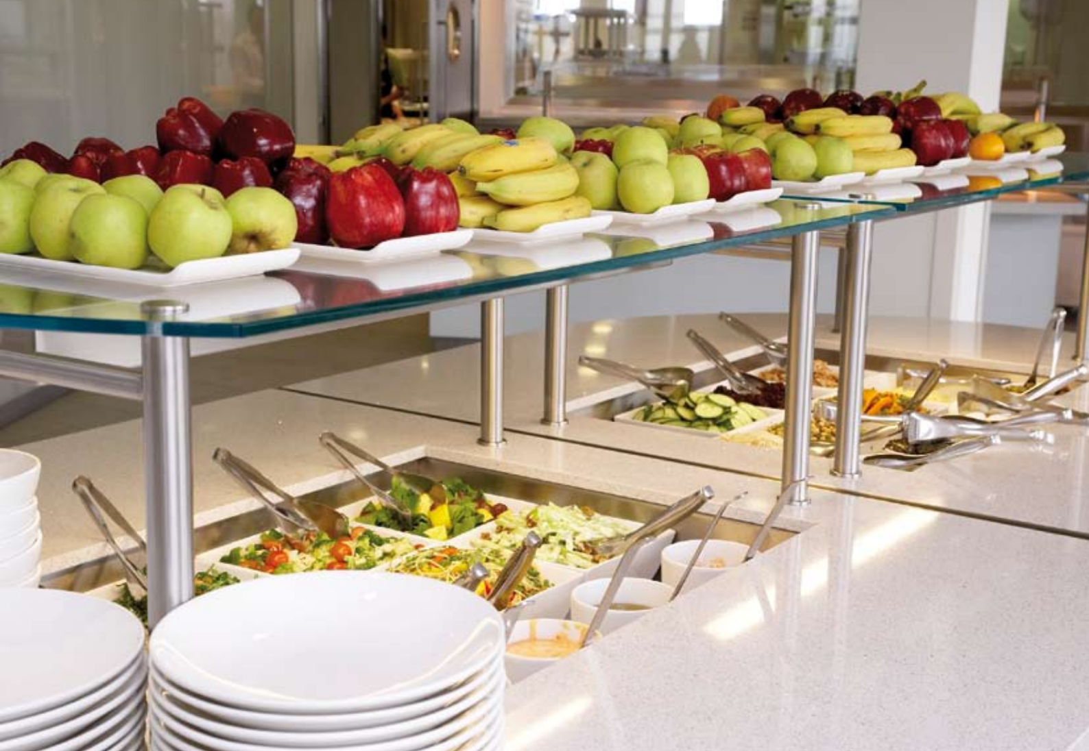
Unilever offers free fruit to encourage employees to meet 'five a day' consumption targets

massages on site, full occupational health service, life style/concierge services.