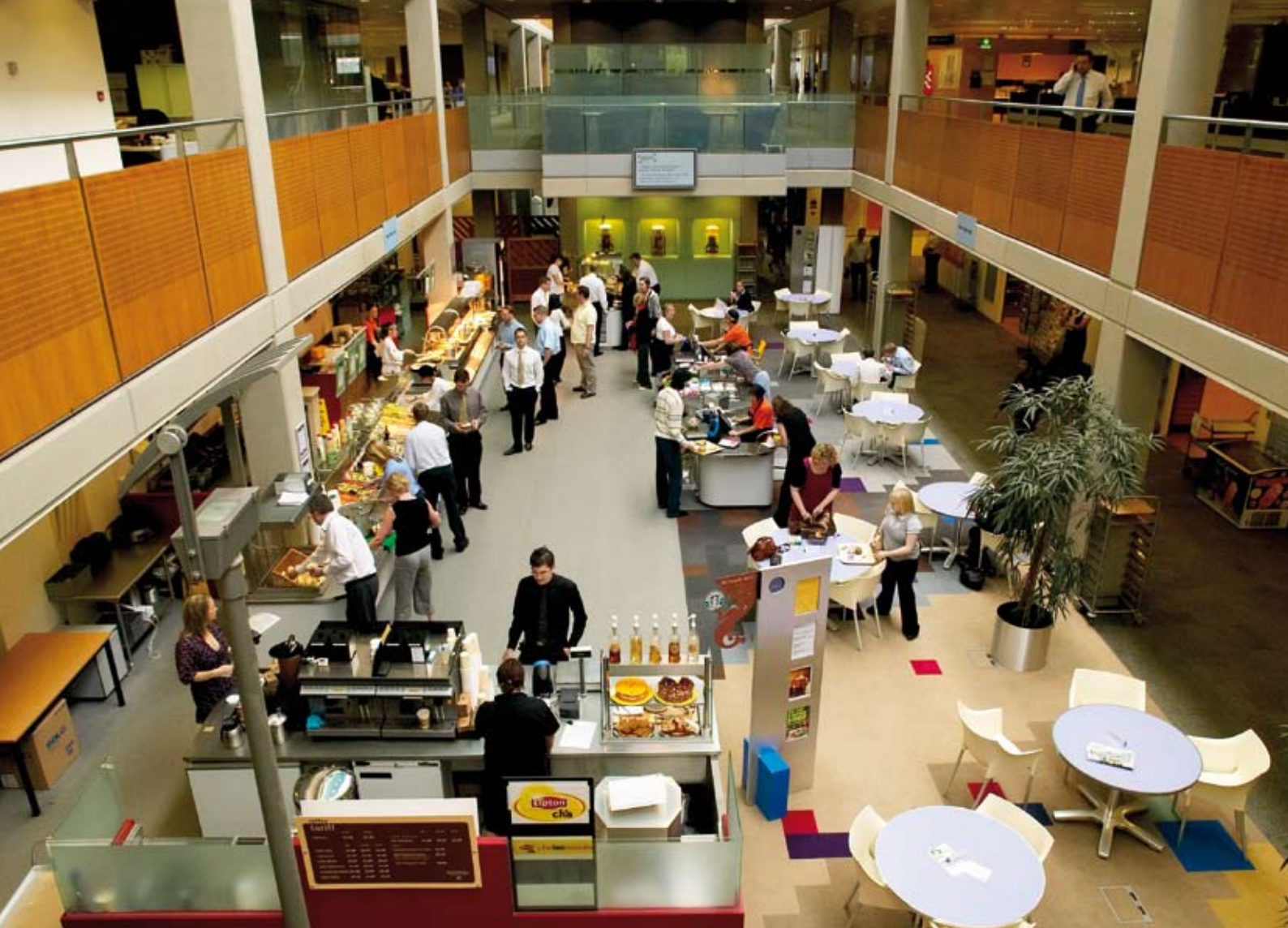
At Boots, creating a healthy dining environment at work helps employees discover the personal benefits of eating well

to discover for themselves the personal benefits of eating well, which include “anything from having greater energy and enjoying life more as a result, to helping reduce the risk of health issues via diet management, adapting your diet to your personal circumstances.” Interactive workshops which featured simple solutions - such as free fruit, unlimited free access to water, vouchers to encourage eating healthily at home and at work - were most effective in achieving this goal.