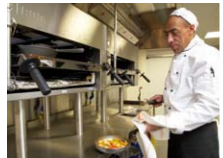
Cadbury offer grilled food as a healthy, yet tasty, alternative to a fry up

The psychological experience of work itself also influences what and how we eat. Research by business psychologists Pearn Kandola found that stressful encounters such as having a row with a colleague, meeting the boss or missing a deadline could all lead to increased snacking during the working day. Women and men were shown to respond differently by job stress, with women being more likely than men to drink too much coffee, eat high-calorie snacks,