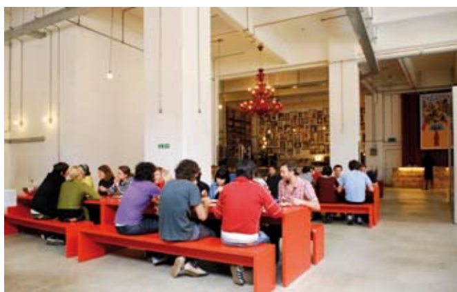
Creative agency Mother believe spending time with others while dining helps strengthen social relationships at work and provides informal opportunities for sharing knowledge within and across teams