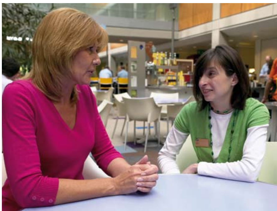
Boots working with ARAMARK proves that by engaging your caterer in planning discussions, you can ensure successful delivery of a healthy eating initiative in your workplace

To keep the programme fresh and relevant, update its contents in light of feedback from employees and the changing needs and risks of the workforce. Repeat the needs analysis on an annual basis, measure the outcome of your interventions and adjust these accordingly.