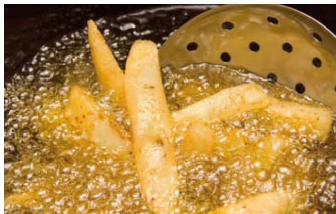
Caterers can complement chips with a variety of vegetables to help employees achieve a balanced diet

Your healthy eating initiative will consist of the interventions needed to address the goals you have identified in Step 6, based on the core framework in step 5. It is essential that that these interventions are based on sound nutrition. The Food Standards Agency's '8 tips for eating well', together with the additional resources described at the end of this toolkit can help you to ensure this is the case. It is also helpful to consider the areas in which it is possible to influence the food offering. In any setting, these are likely to be: procurement (i.e., the ingredients and products purchased), kitchen practice (i.e., how they are prepared and cooked); menu planning (i.e., the choices that are available and how they are promoted); and consumer information. Initiatives are likely to be most effective when they include a series of co-ordinated actions in these areas.