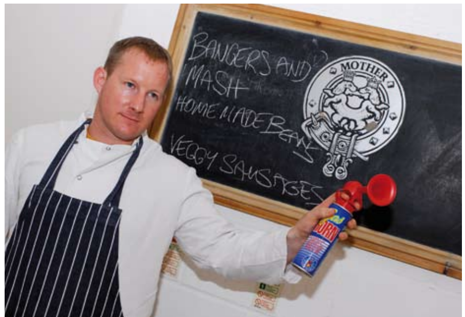
At Mother creative caterers find innovative ways to 'blow the horn' for healthy meal options

Food services provider ARAMARK have had employee assistance programmes, all inclusive Health and Safety procedures and measurements and healthy eating programmes in place for many years. With the launch of their corporate responsibility programme, this is forming part of a Health and Wellbeing programme that will take this critical area to a new level. The human resources and corporate responsibility teams are working closely together to develop a package that will fulfil all of the stakeholders needs. A new Healthy Eating Programme is being piloted and due to be fully rolled out by the end of 2008. As part of the launch, all team members will be trained on the importance of healthy eating and how they can look after themselves in this area. By giving