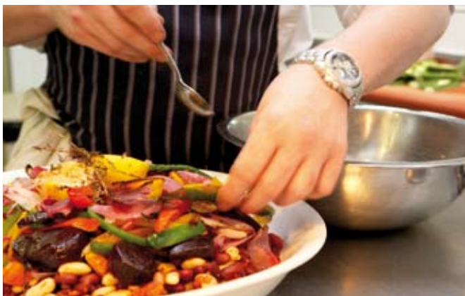
At Unilever, offering appetising, yet nutritious, dishes in staff restaurants helps to achieve 'health by stealth' in the workplace